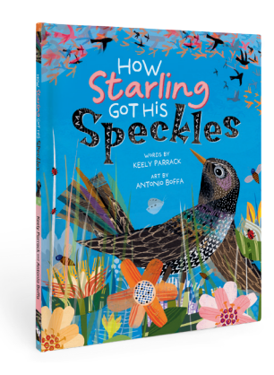
How Starling Got His Speckles Written by Keely Parrack Illustrated by Antonio Boffa

You can make up your own collective nouns. Make a list of birds and then look at their color, behavior, and personality. For example, blue jays are so blue that you could call a group of them 'a sapphire of jays.' They are also so noisy, you could call them 'a squawk of jays' — but they are also so smart that you could call them 'a brightness of jays!' See what fun collective nouns you can come up with for the birds on your list!