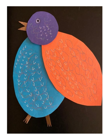
10 . Pin up multiple starlings to make a murmuration display on your home or classroom wall!