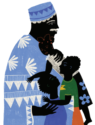
Illustration © Diana Ejaita from I'll See You in Ijebu