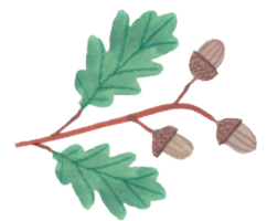
from The Midnight Mitzvah