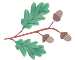
from The Midnight Mitzvah