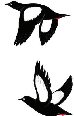
from Stranded! A Mostly True Story from Iceland